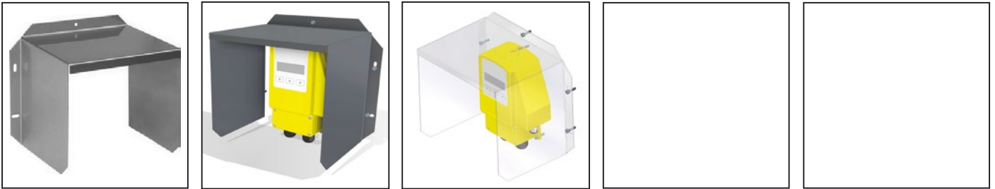
Weather shield with sensor... and screwing